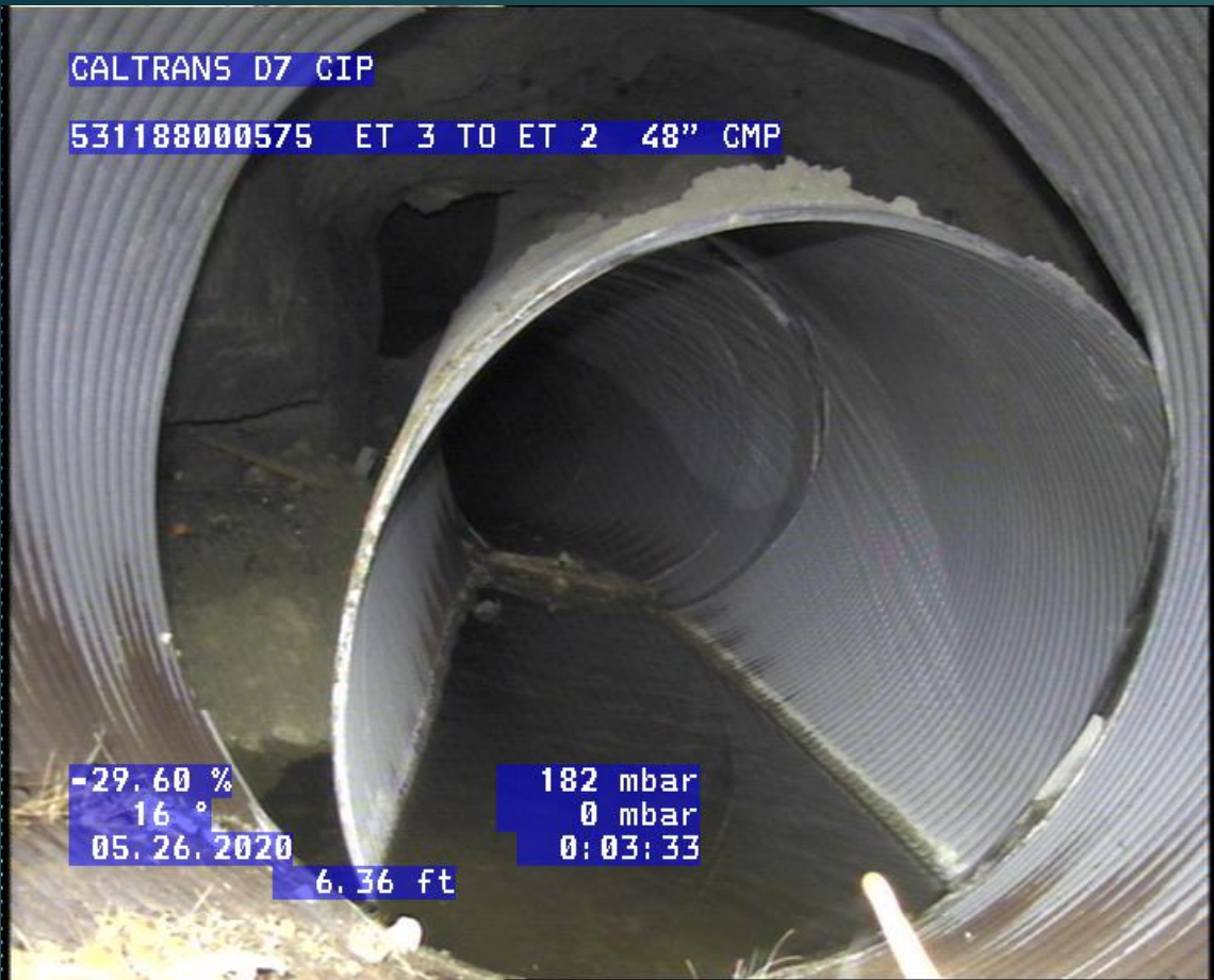
Broken connection at the Storm Drain Manhole on Rinaldi Street