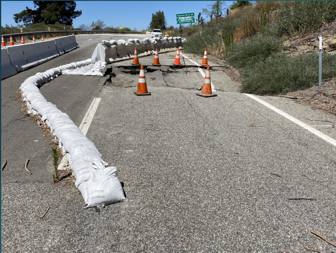
Sandbags to prevent storm runoff from entering the failed AC pavement