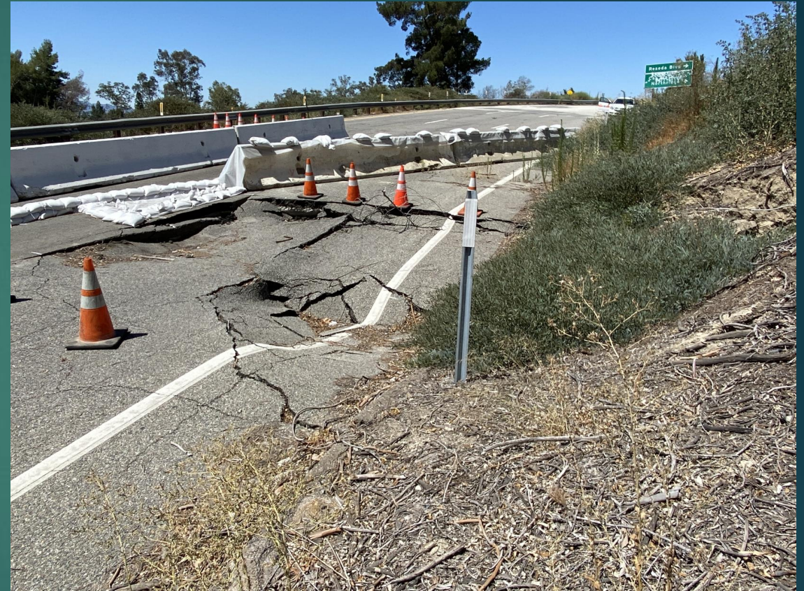
Pavement cracks & separation on lane #3 of Reseda Off-ramp