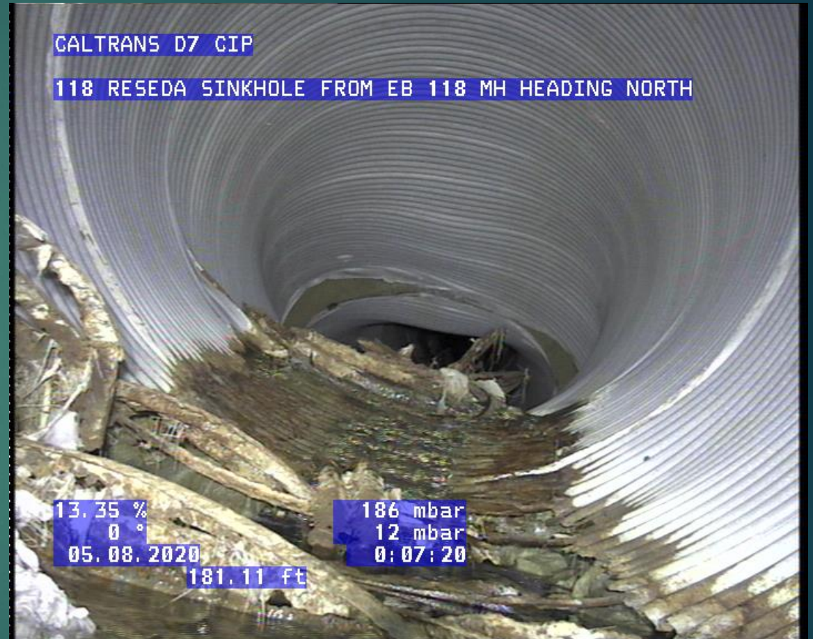
Collapsed drainage pipe under Lanes #2 & #3 of the Reseda Off-ramp