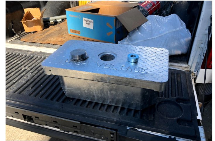
Steel Lid Components