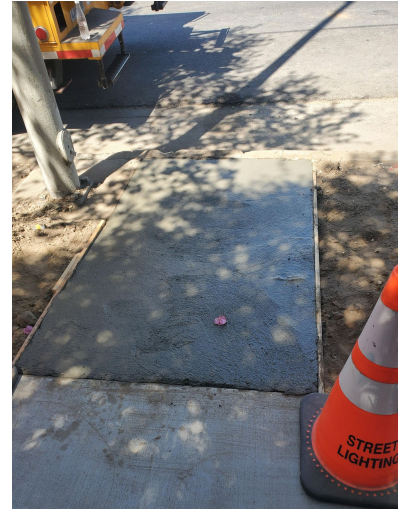
Pullbox buried under concrete (from curb to sidewalk)