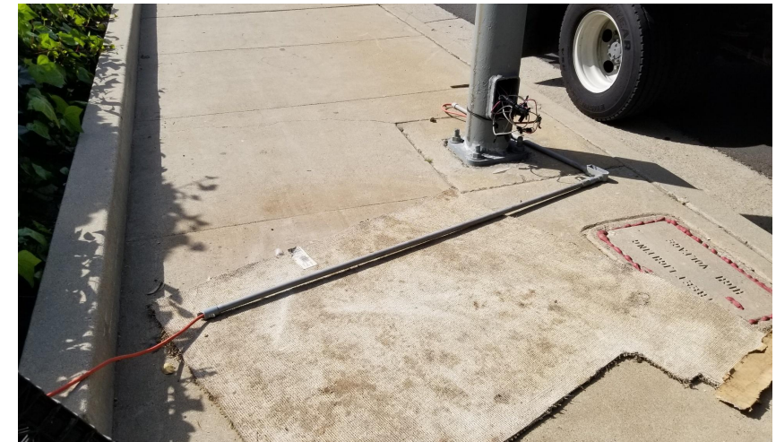
Examples of Power Theft