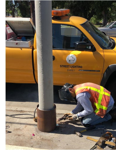
Welding shut handhole