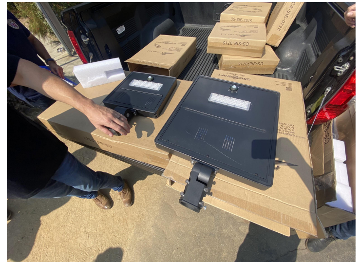
Cuesta Sol All-in-One Light (Model #2731)