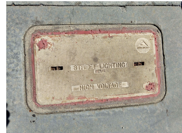
Seal Handholes and Pullboxes with Epoxy