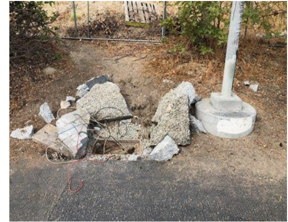
Examples of Wire Theft